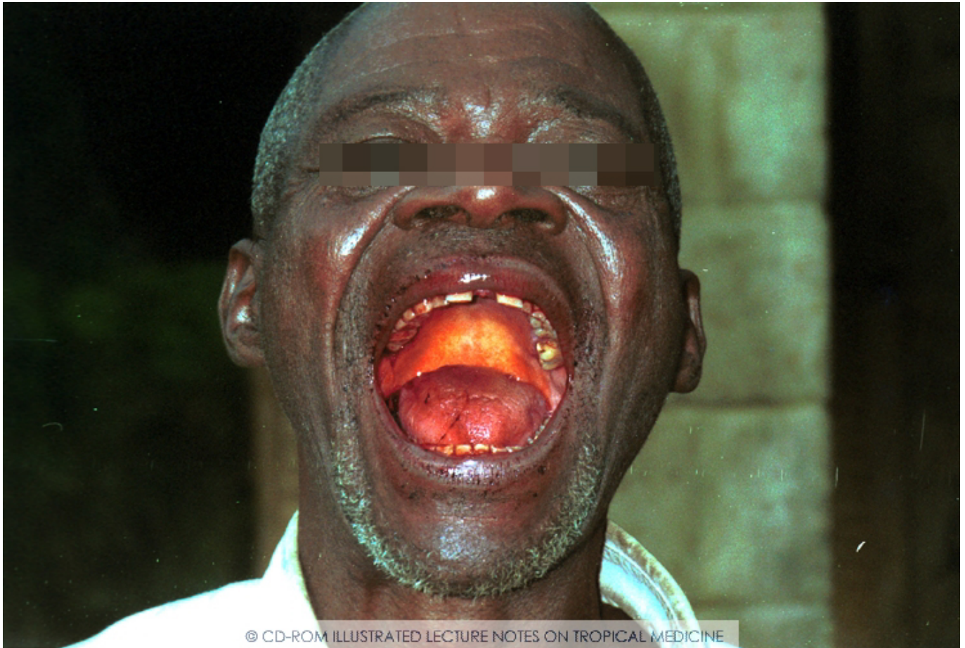
Ebola, 2003, Kelle, Congo. Patient presenting with bleeding gums, a sign of haemorrhagic diathesis.

The clinical disease is not called Ebola haemorrhagic fever anymore but Ebola virus disease (EVD) which downplays bleeding as a clinical hallmark and stresses the great variability in symptoms. After an incubation period of 2 to 21 days (average 7 days) infection often leads to multiple organ failure, with death occurring on average 6 to 9 days after the onset of symptoms. But asymptomatic infection with Ebola can occur. People infected with Ebola virus initially present with nonspecific febrile illness with malaise, fatigue and myalgia. In a second stage, gastro-intestinal symptoms with anorexia, nausea, abdominal pain, vomiting and diarrhoea develop. Patient can lose up to 10 liters per day and severe electrolyte disturbances rise: hypokalaemia, hyponatremia, hypomagnesemia, ... Dysphagia, headache, conjunctival injections, maculopapular rash and joint pain are other common symptoms. Hiccups can be caused by uncontrolled diaphragm contractions due to viral invasion of the