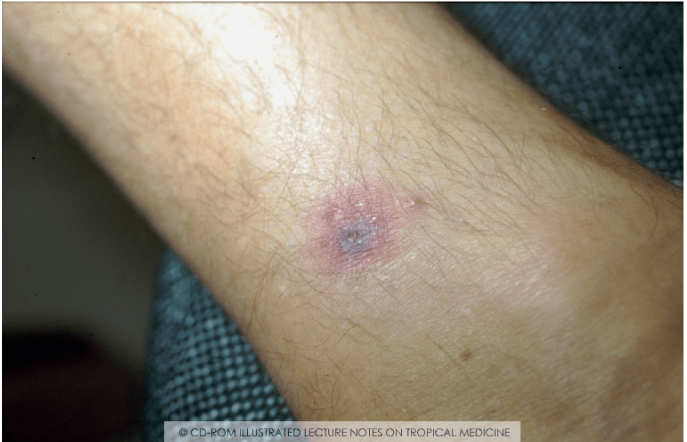
Inoculation chancre, Rickettsia conori