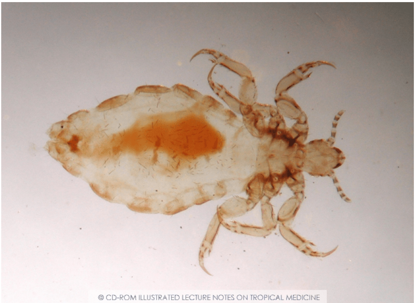
Pediculus humanus capitis . Head louse.

Note: the body louse is also the vector of recurrent fever (see borreliosis) and trench fever.